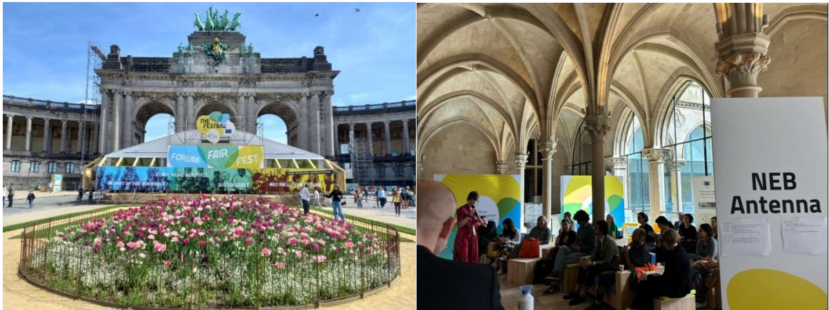
The Art and History Museum, Brussels, the setting for exhibitions, workshops and the New European Bauhaus prize-giving ceremony